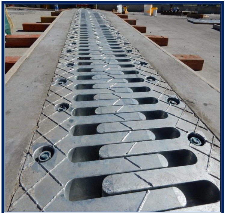
EJC 200 and footpath with anti-skid