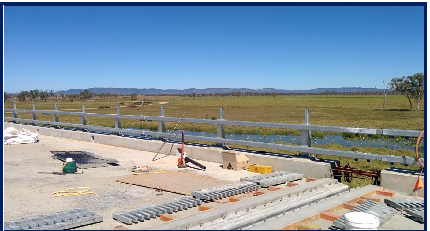
Anchors Bolts M22 of EJF after concreting